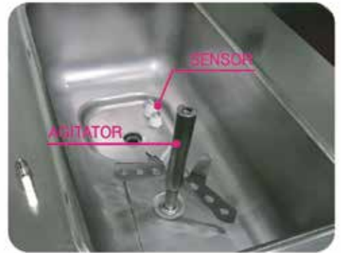
Agitator Mix out & mix low sensors