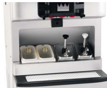
Integrated Syrup Rail Option - 2 room temperature with lids & ladles, 2 heated with syrup pumps

During long no-use periods, the standby feature maintains safe product temperatures in the mix hopper and freezing cylinder.